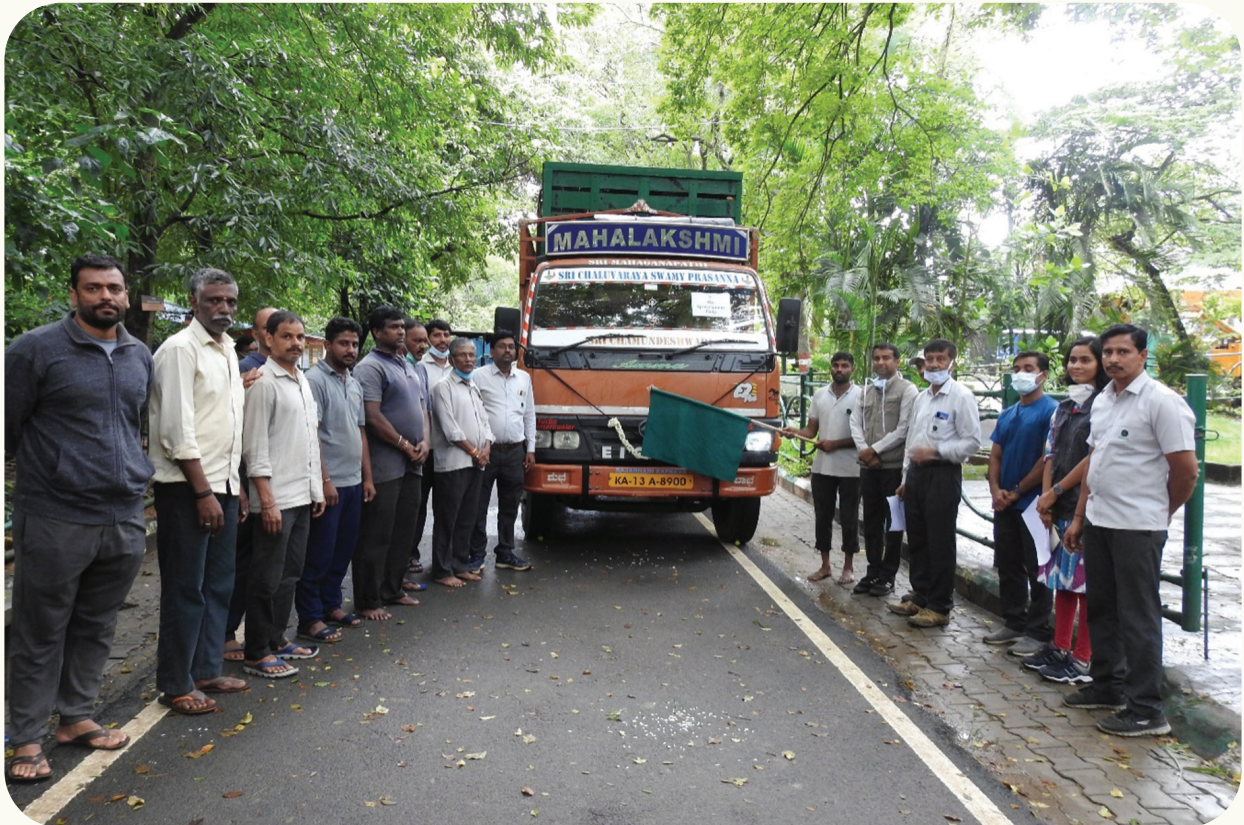
Animal Exchange programme – Shivamogga Zoo