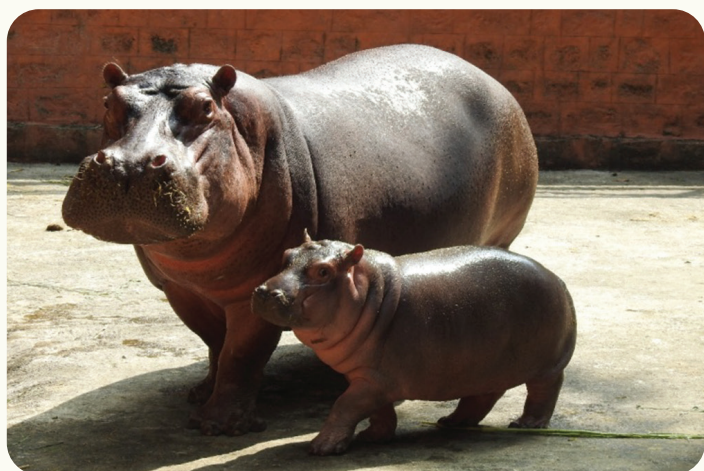
Hippopotamus with calf