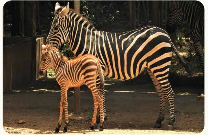
Zebra with Foal