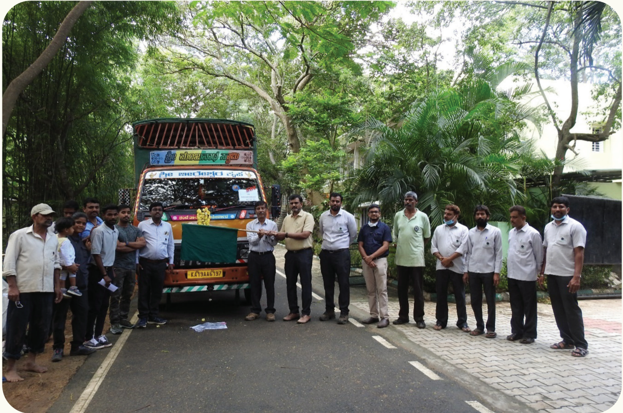
Animal Exchange programme – Belgaum Zoo