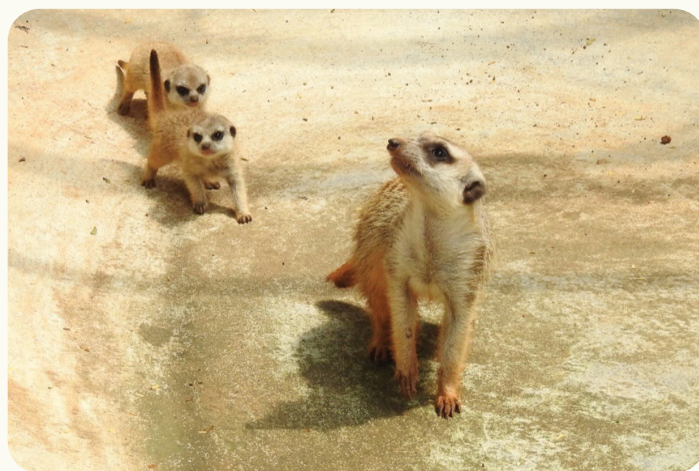
Slender Tailed Meerkat with Pups